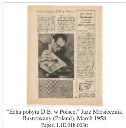
"Echa pobytu D.B. w Polsce," Jazz Miesiecznik Ilustrowany (Poland), March 1958 Paper, 1.1E.01b.003tt