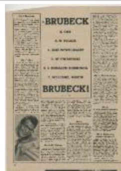
Lucjan Kydrynski, "Brubeck gra w Polsce..." Prze Kroj (Poland), 1958 Paper, 1.1D.01.012s