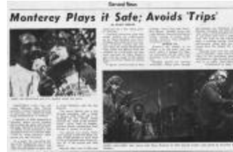
Eliot Tiegel, "Monterey plays it safe," Billboard, October 2, 1971 Paper, 1.1E.04.004cc