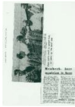
"Brubeck, jazz magician is here," Ceylon Observer (Sri Lanka), April 15, 1958 Paper, 1.1E.01b.003kkk