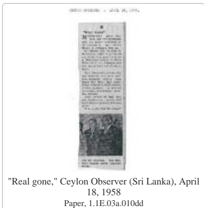
"Real gone," Ceylon Observer (Sri Lanka), April 18, 1958 Paper, 1.1E.03a.010dd