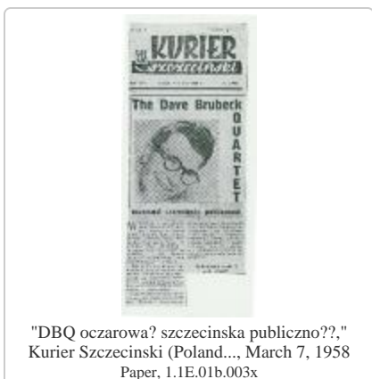
"DBQ oczarowa? szczecińska publiczność?," Kurier Szczeciński (Poland), March 7, 1958 Paper, 1.1E.01b.003x