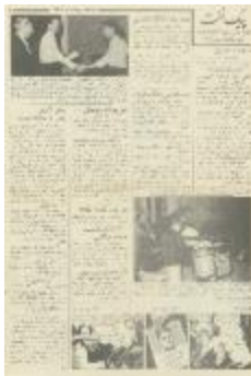
Abadan Oil Courier (Iran), May 1958 Paper, 1.1E.01b.003yyy