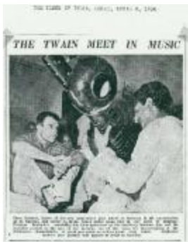
"The twain meet in music," Times of India (New Delhi, India), April 8, 1958 Paper, 1.1E.01b.003ddd