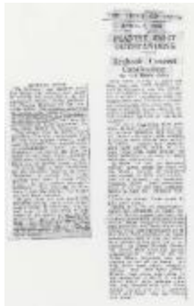
"Brubeck concert captivating," Times of India (New Delhi, India), April 4, 1958 Paper, 1.1E.03a.010t