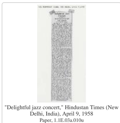
"Delightful jazz concert," Hindustan Times (New Delhi, India), April 9, 1958 Paper, 1.1E.03a.010u