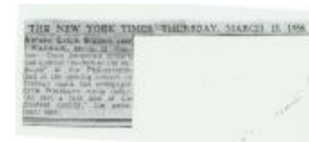
"Warsaw extols Brubeck jazz," New York Times (New York), March 13, 1958 Paper, 1.1E.01b.003y