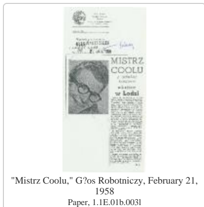
"Mistrz Coolu," Głos Robotniczy, February 21, 1958 Paper, 1.1E.01b.003i