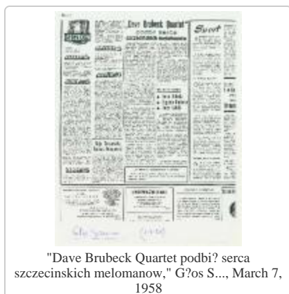
"Dave Brubeck Quartet podbi? serca szczecińskich melomanów," Głos S..., March 7, 1958