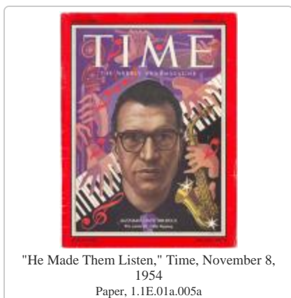
"He Made Them Listen," Time, November 8, 1954 Paper, 1.1E.01a.005a