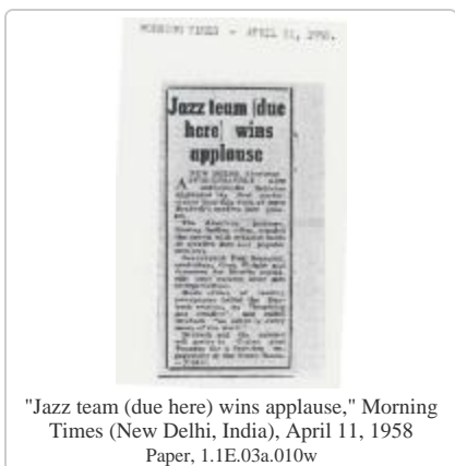
"Jazz team (due here) wins applause," Morning Times (New Delhi, India), April 11, 1958 Paper, 1.1E.03a.010w