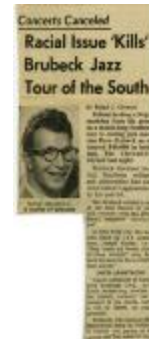
Ralph J. Gleason, "Concerts canceled: Racial issue kills Brubeck ja..., 1960 Paper, 1.1D.02.001y