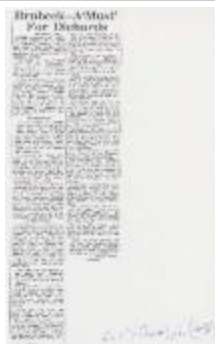
Solie Petit, "Brubeck---A must for diehards" (India), April 1958 Paper, 1.1E.03a.010kk