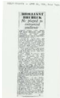
"Brilliant Brubeck," Ceylon Observer (Sri Lanka), April 17, 1958 Paper, 1.1E.03a.010aa