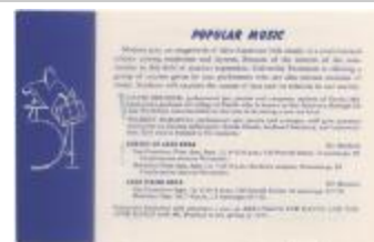
Lifelong Learning, August 8, 1949 Paper, 1.1D.01.003c