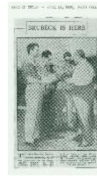
"Brubeck is here," Times of Ceylon (Sri Lanka), April 15, 1958 Paper, 1.1E.01b.003jjj