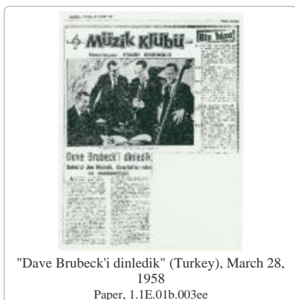
"Dave Brubeck'i dinledik" (Turkey), March 28, 1958 Paper, 1.1E.01b.003ee