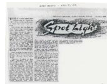
"Spotlight," Ceylon Observer (Sri Lanka), April 20, 1958 Paper, 1.1E.03a.010ff