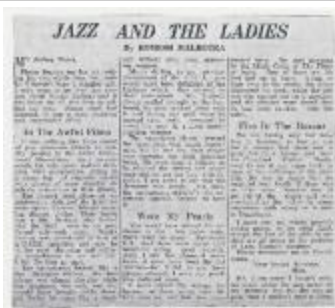
Romesh Malhotra, "Jazz & the ladies" (India), April 1958 Paper, 1.1E.03a.010jj