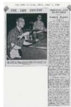
"The jazz concert -- original & enjoyable," Times of India (New Del..., April 9, 1958 Paper, 1.1E.03a.010v