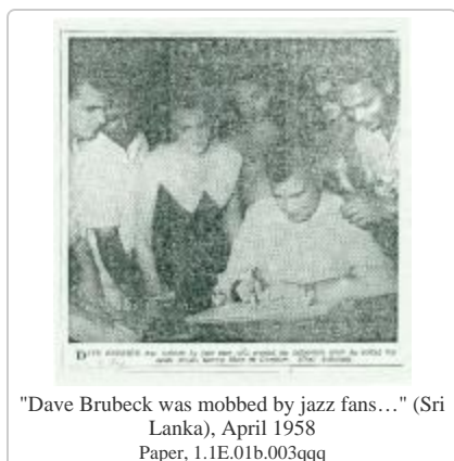
"Dave Brubeck was mobbed by jazz fans..." (Sri Lanka), April 1958 Paper, 1.1E.01b.003qqq