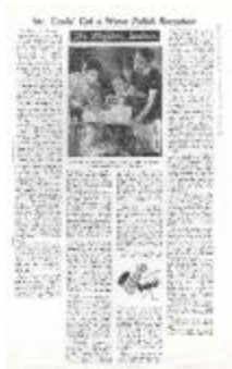
Ralph J. Gleason, "Mr. Coolu Got a Warm Polish Reception," The San ..., April 6, 1958 Paper, 1.1D.01.012f