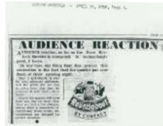
"Audience reaction," Ceylon Observer (Sri Lanka), April 17, 1958 Paper, 1.1E.03a.010bb