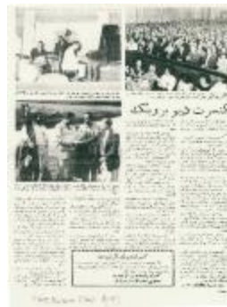
Abadan Musician (Iran), May 1958 Paper, 1.1E.01b.003xxx