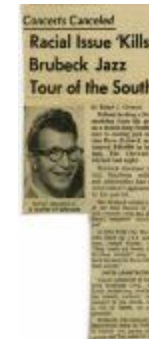
Ralph Gleason, "Concerts Canceled, Race Issue 'Kills' Brubeck Jazz ..., 1960 Paper, 1.1E.01b.005kkk