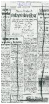
"Dave Brubeck dla Czytelników G?osu," G?os Robotniczy, March 18, 1958 Paper, 1.1E.01b.003bb