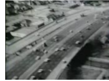
The Lively Ones, "Blue Rondo on a Magic Carpet" (Dave Brubeck, Paul..., July 25, 1962) Moving Image, 1.5G.01.007

Thelonious Monk: Straight No Chaser, 1986 Moving Image, 1.5C.01.013