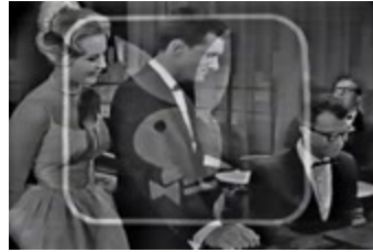
Dave Brubeck Quartet at Playboy Club (Chicago, Illinois), 1961 Moving Image, 1.5A.01.014

Dave Brubeck Quartet concert (Brussels, Belgium), October 10, 1964 Moving Image, 1.5G.01.011